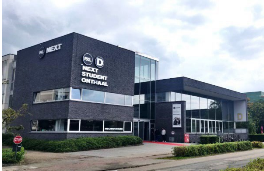
Building D PXL Next

Student Administration International Office Student Services Book shop Restaurant PXL-Catering Campus Police